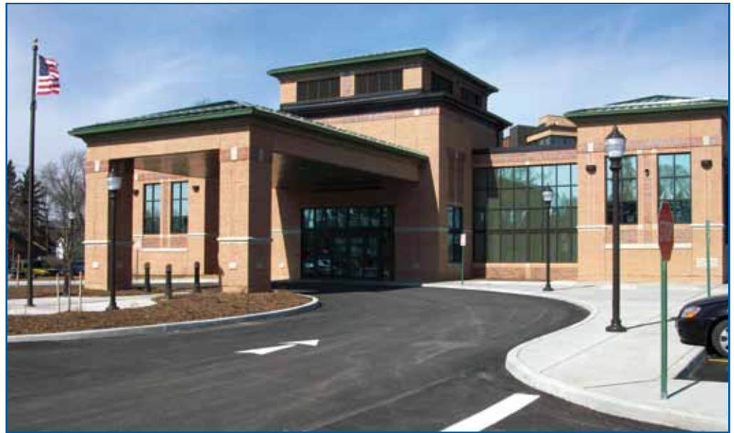
The new Surgical Expansion space at the United Memorial Medical Center

The first surgical procedures were indeed performed on time as expected on January 4th. When arriving at UMMC between the hours of 6AM and 7PM, patients and visitors to United Memorial should utilize the parking in front of the Hospital entrance and enter the facility through